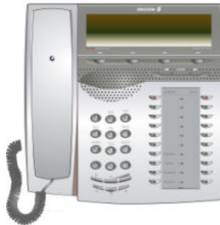
Dialog 4425, Feature IP