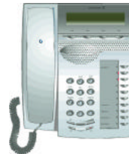
Dialog 4186 High