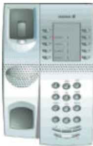
Dialog 4106 Basic